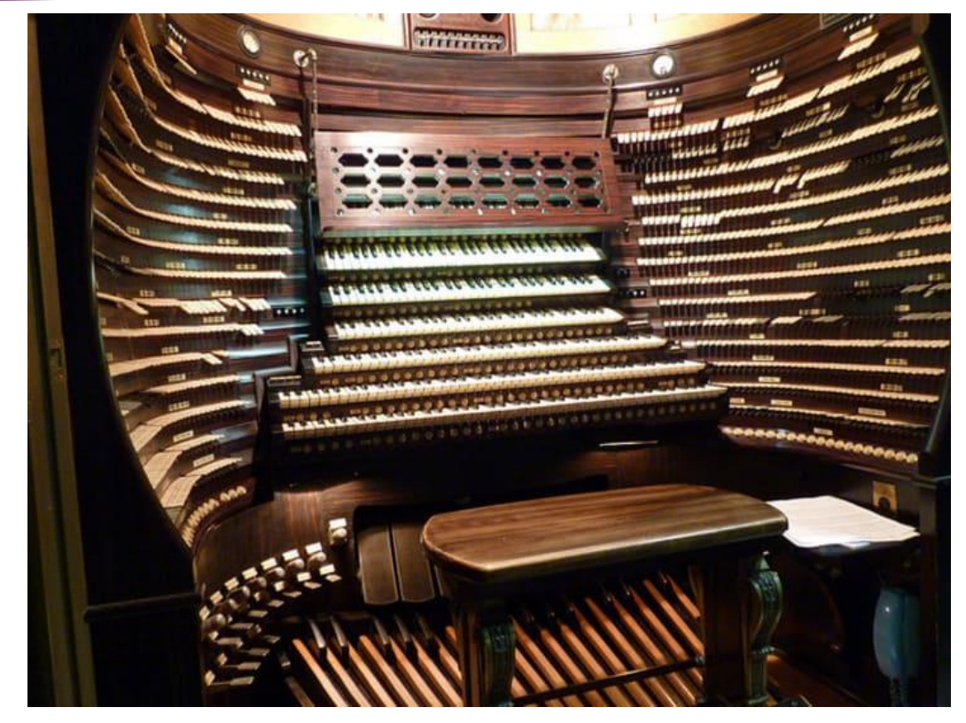
BOARDWALK HALL AUDITORIUM ORGAN

The <u>Boardwalk Hall Auditorium Organ</u> in Atlantic City, New Jersey, is the largest pipe organ ever built, based on the number of pipes. When the hall <u>opened</u> in 1929, the seating capacity was 42,000 people. To fill that huge space, the organ uses <u>over 33,000 pipes!</u> The console has seven keyboards and more than 1200 stops.