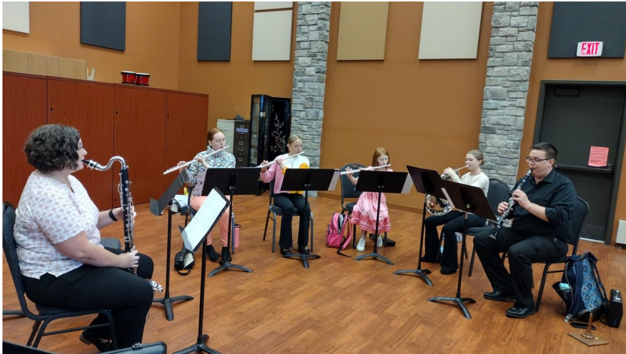
Wind Ensemble Rehearsal