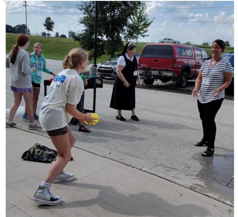
End of the Day Water Balloon Activity