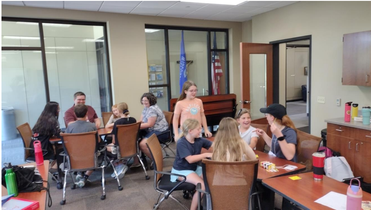
Campers in Recreation Room