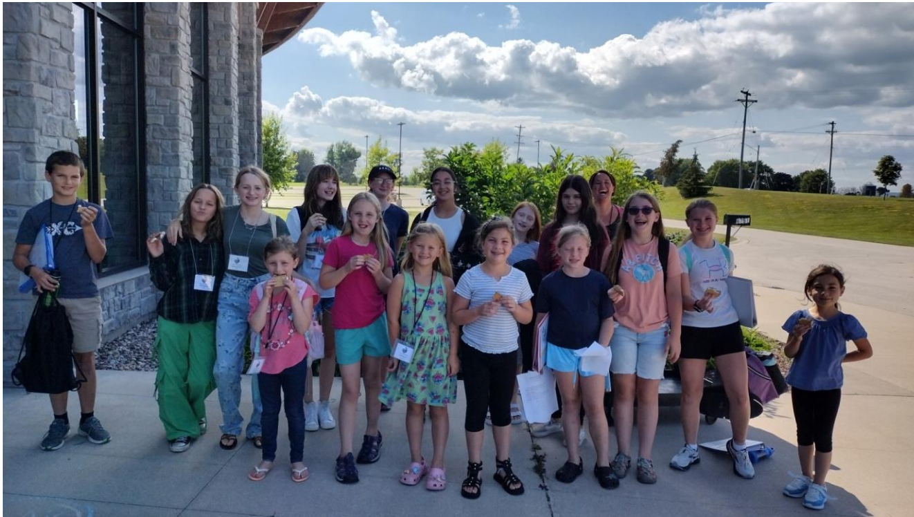
S'Mores at the end of a full and fun day of learning