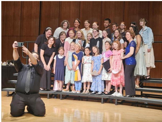
Camp Choir concert day