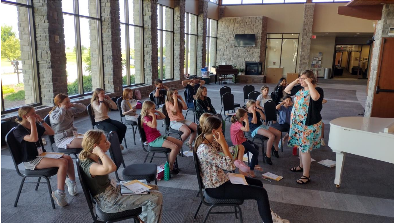
Camp Choir Rehearsal