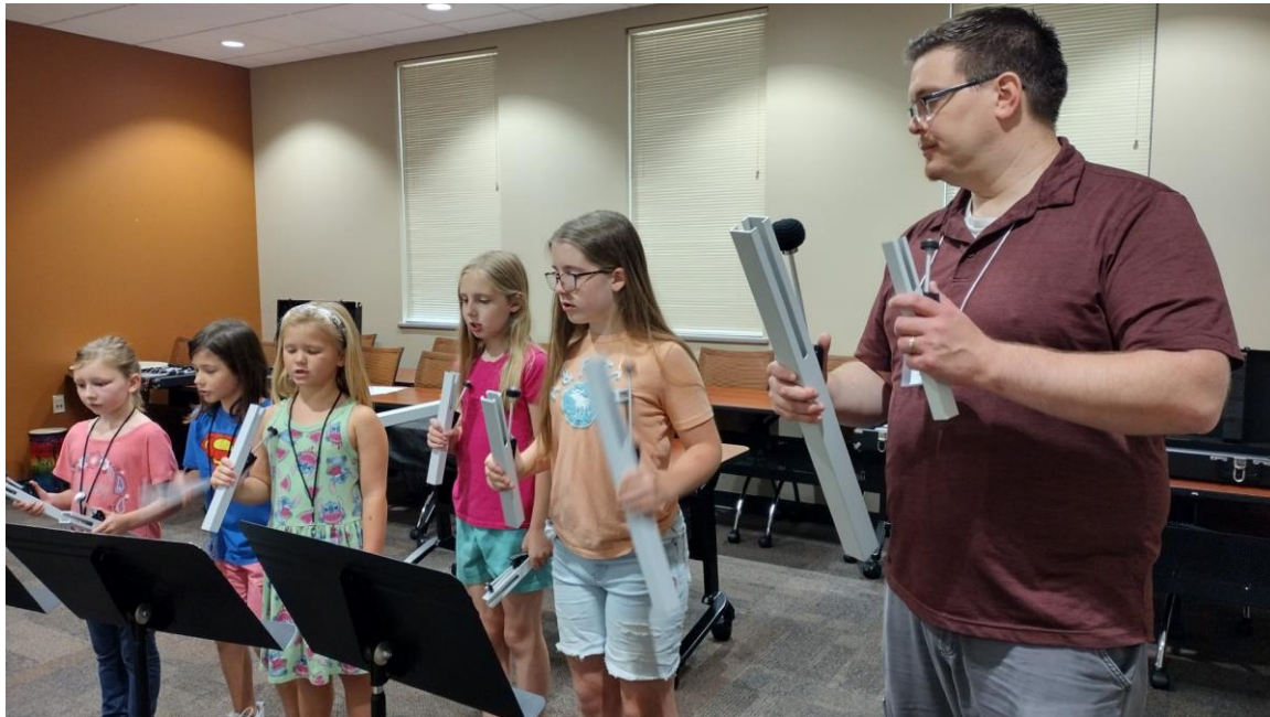
Handbells for Half-Day Campers