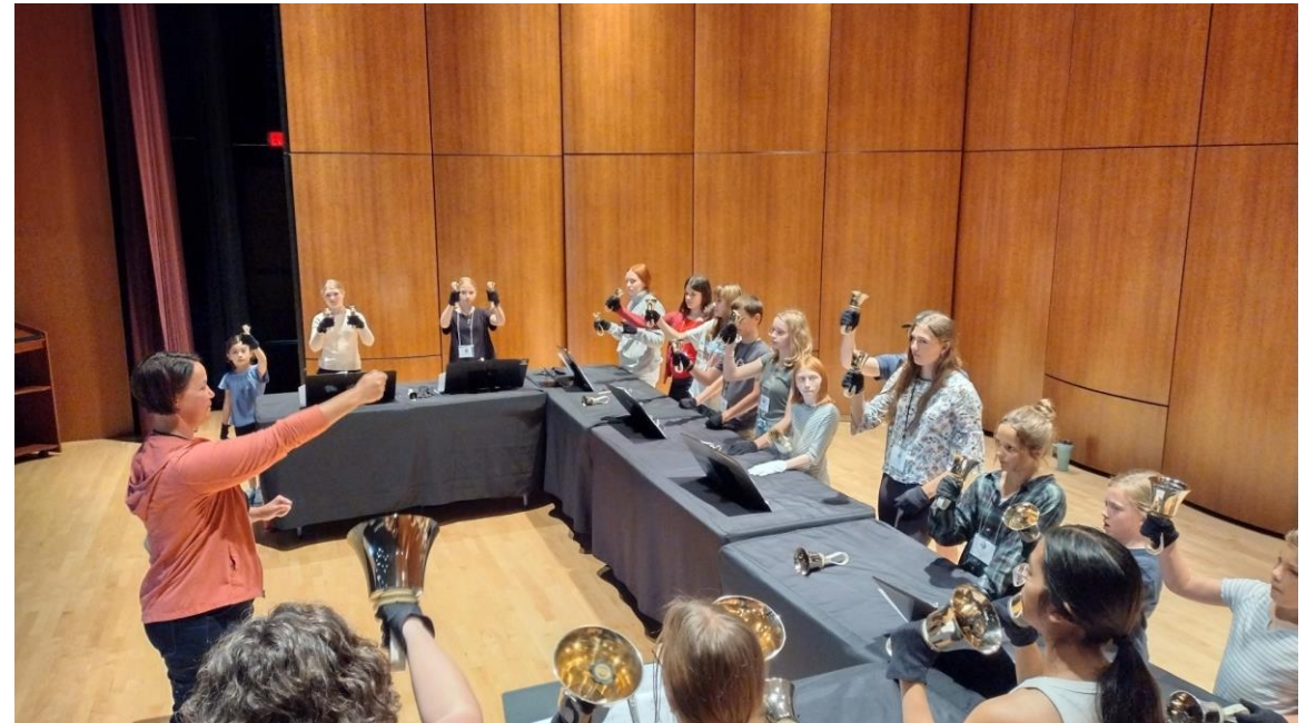
Handbells for Full-Day Campers