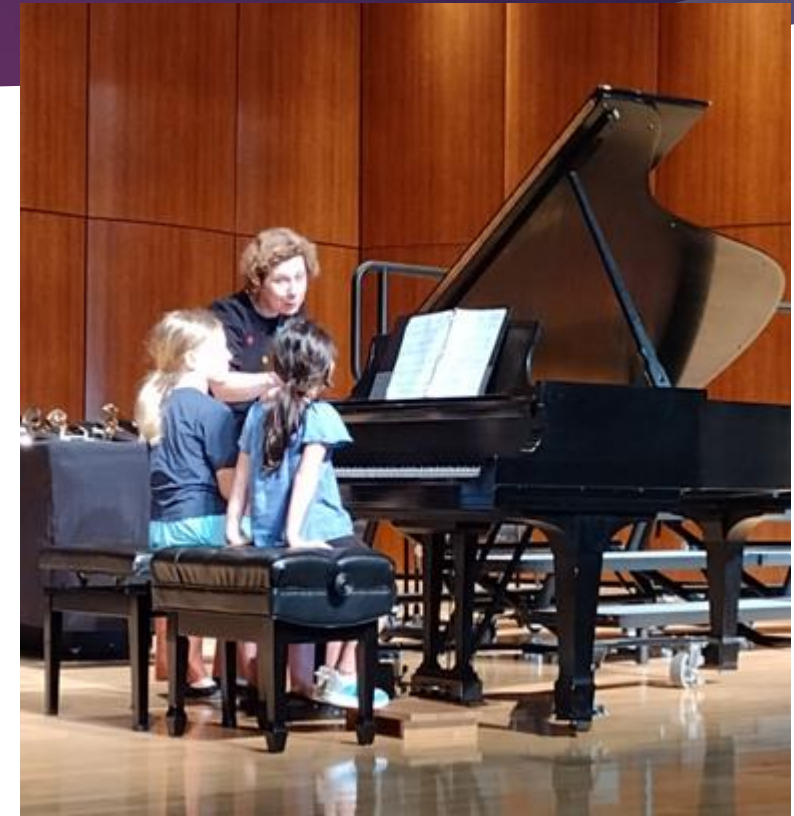
Piano Ensemble Rehearsal