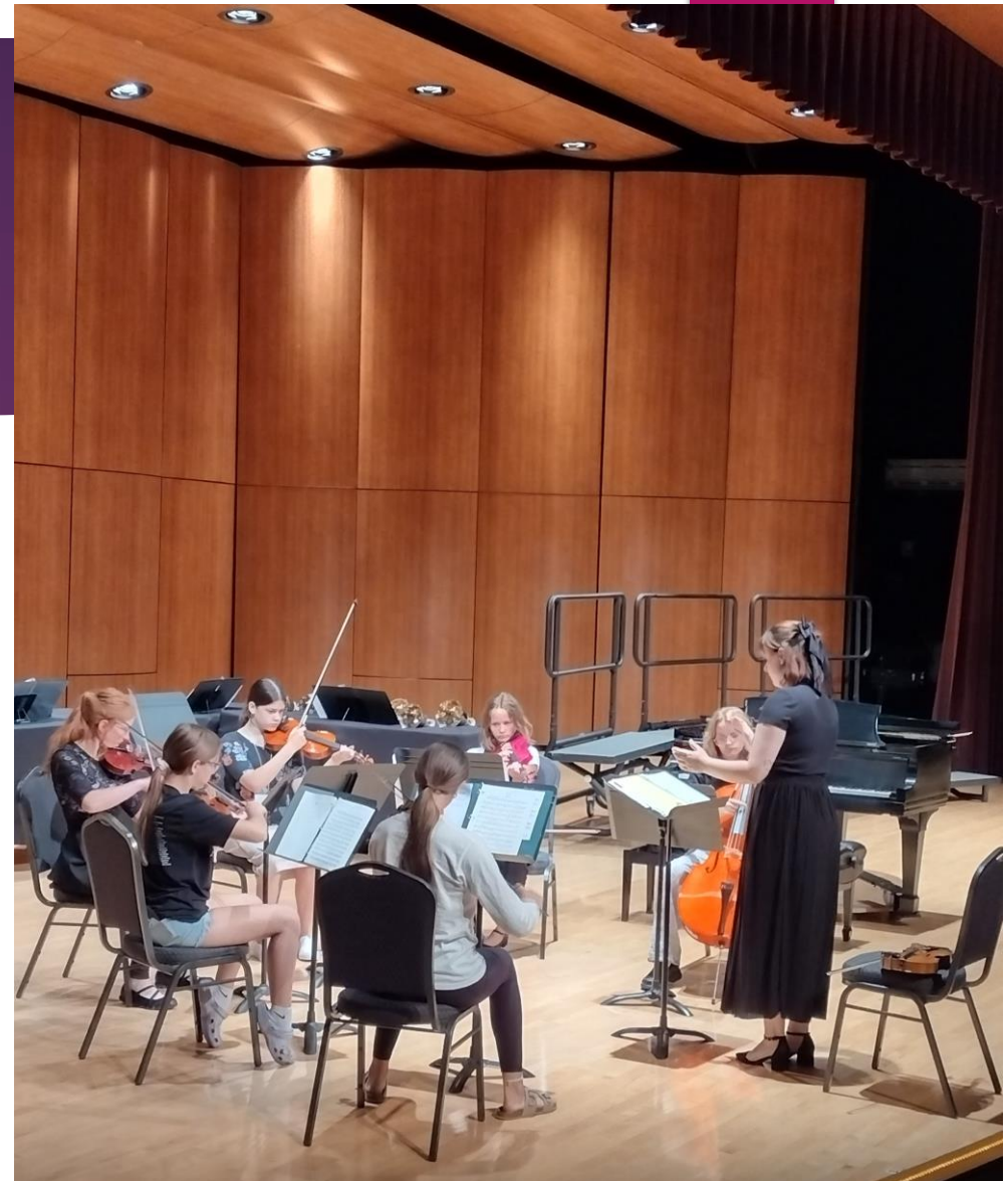
String Ensemble Rehearsal