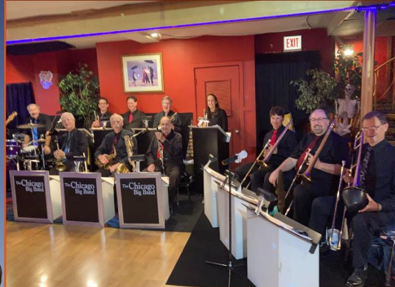
SOUNDS OF CHRISTMAS THE CHICAGO BIG BAND 2:00 PM DECEMBER 17, 2023