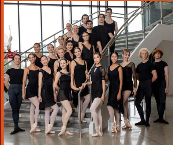
MILWAUKEE BALLET II 2:00 PM APRIL 28, 2024