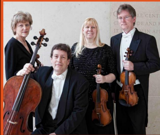
PRO ARTE QUARTET 2:00 PM MARCH 10, 2024